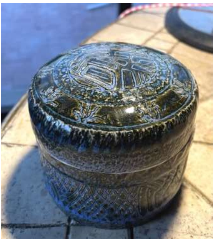
is seaweed over Firebrick. Brian was recently photographed by Sue Peetom after he had spent some time on the wheel throwing a large dish.