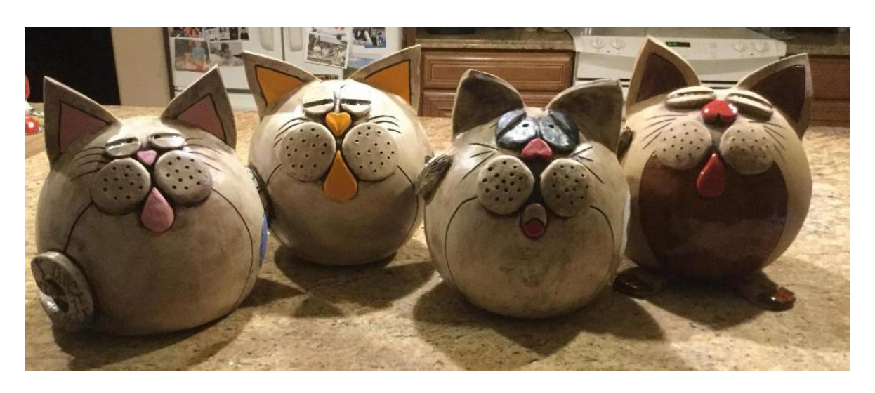
Four cat heads.