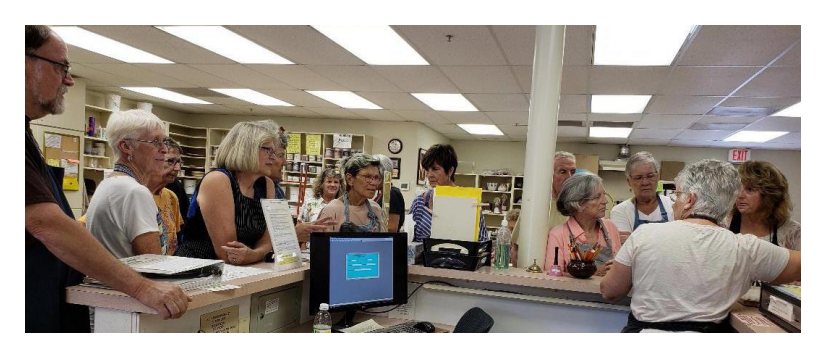
September Intro classes learning at the monitor's desk

Have your pieces in the holding room and enter the patio through the back outside door by 8:30 am.