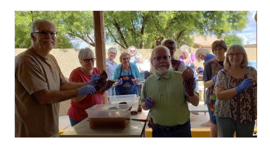
October Intro class learning oxide on the patio