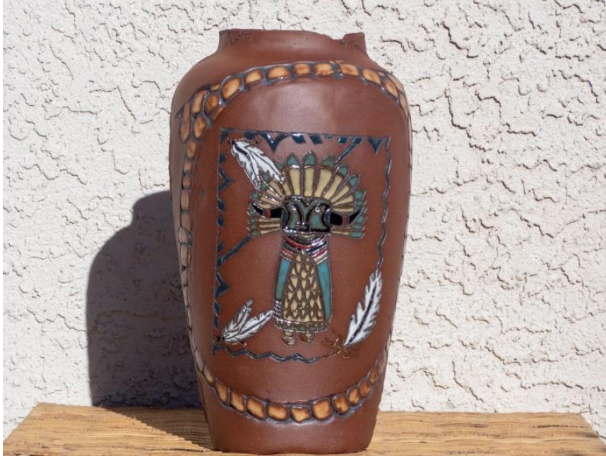
This lovely Corn Kachina Vase was