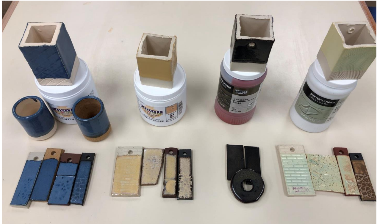
High Fire Glazes:L to R. Blue Cornflower, Unicorn Horn, Iron Stone, and Frosted Melon.