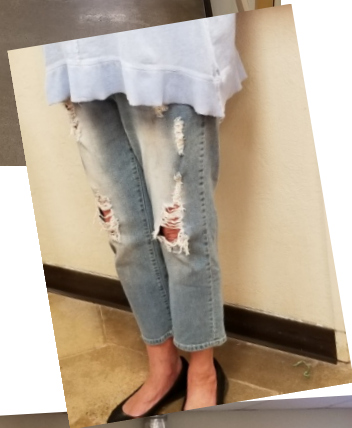
These are hard working jeans!