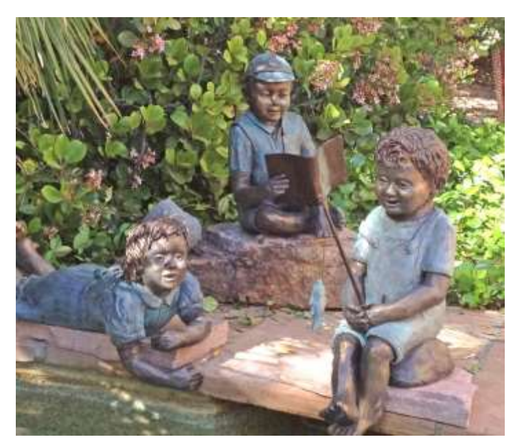
Some of Elenie's work.