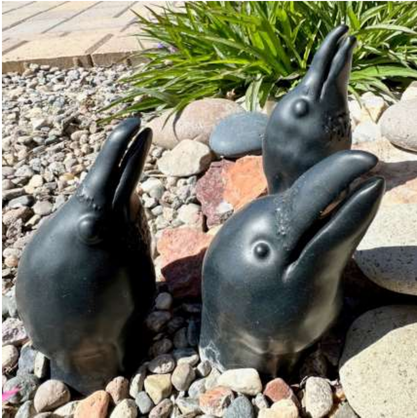
Four and twenty blackbirds baked in the desert .