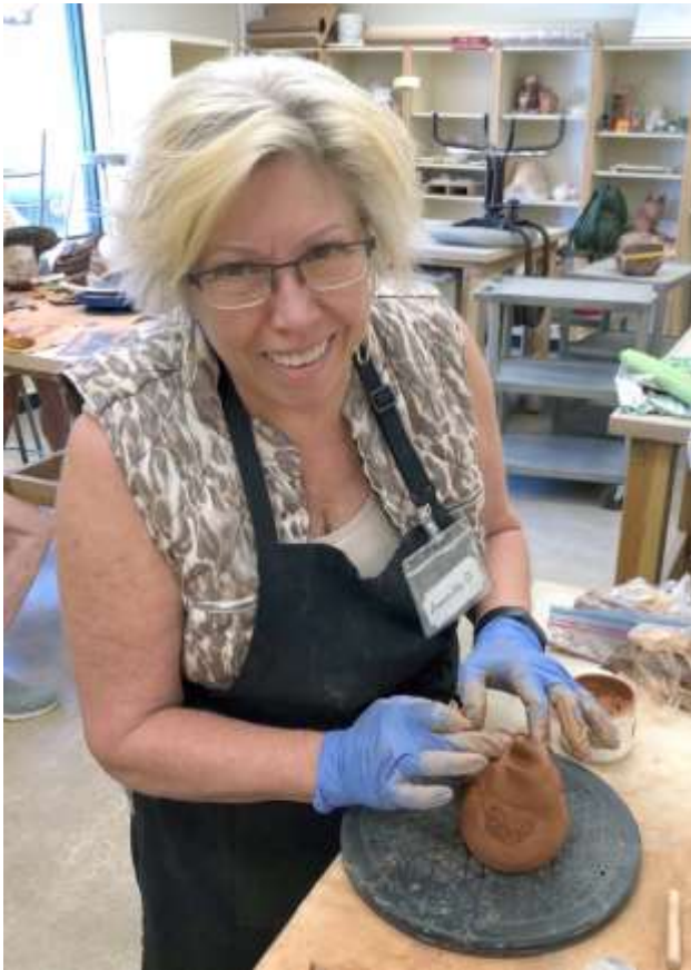
They're just crazy for Ravens

Sit with Sam session in the Sculpture room.