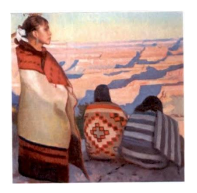
Paintings with Navajo Rugs