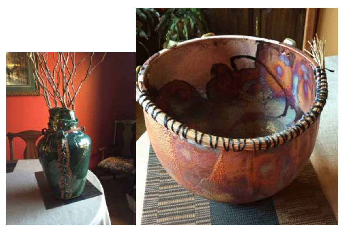
High Fire - Sage Green