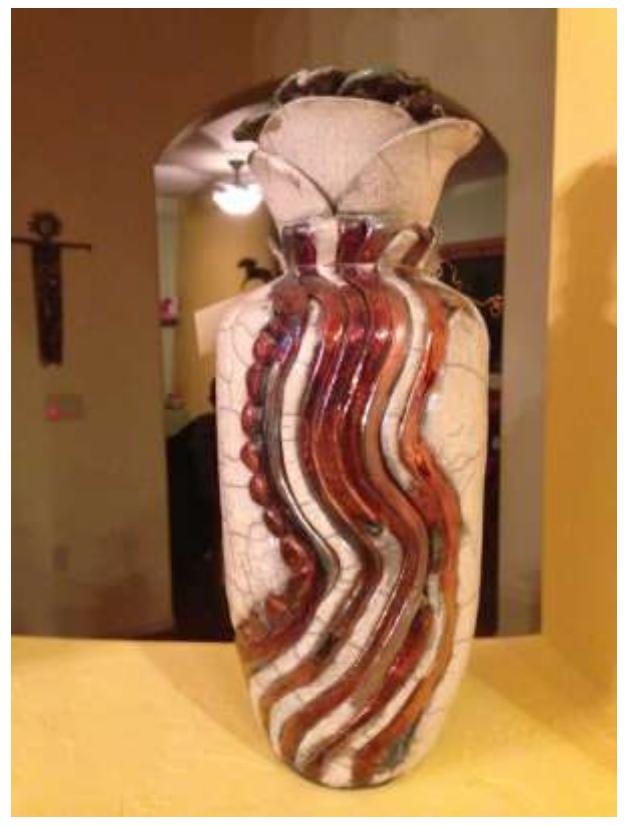
Raku ~ White Crackle and Purple Passion

Fire, and Sager fire. She also uses pine needle weaving on some pieces.