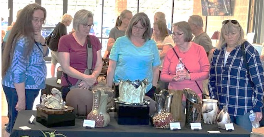
Exhibit Feb. 2 – 28, Canoa Hills Rec Center