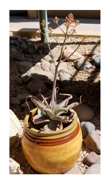
The area outside the

back door has been improved with a totem and two pots. Thanks to the members who contributed their time and talent!